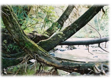
Leiner River Campsite

are washrooms, and stairs down to the rock beach at West Bay. This sheltered little bay is an exception to the deep waters of Tahsis Inlet; it is shallow and southwesterly facing, catching the sun and warming up to comfortable swimming temperatures. Locals frequently