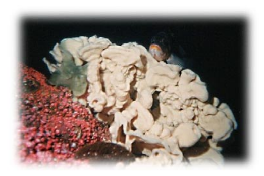
Cloud Sponge and small Rockfish

Little Espinoza Inlet has remarkable biodiversity, and is also a favoured diving spot.