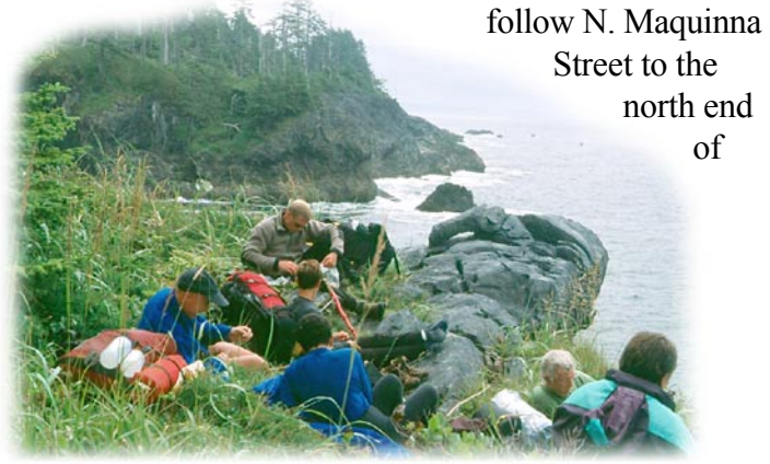
Nootka Trail - Maquinna Point

This ancient trade route was used by First Nations and crosses Vancouver Island from its southern terminus in Tahsis. The route followed the Tahsis River to its headwaters and over a pass to Woss Lake, where the natives paddled the lake and then down the Nimpkish River to the ocean on the northeast side of Vancouver Island. Although not maintained as a marked route, this trail begins at the north end of the Tahsis Dump,