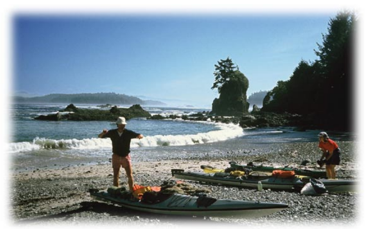
Kayaking Nootka Island

There are also excellent camping spots on Catala Island and Yellow Bluff on the North Shore, but access to both requires crossing open water when the tides are good and water is calm. Fresh water is not always available at either camping spot. From Rosa or Garden point, kayaking in Mary Basin up to Ferrer Point has many advantages. There are lots of little streams, safe protected kayaking, sea otter families, eagles, bears, and marine birds. Mary Basin